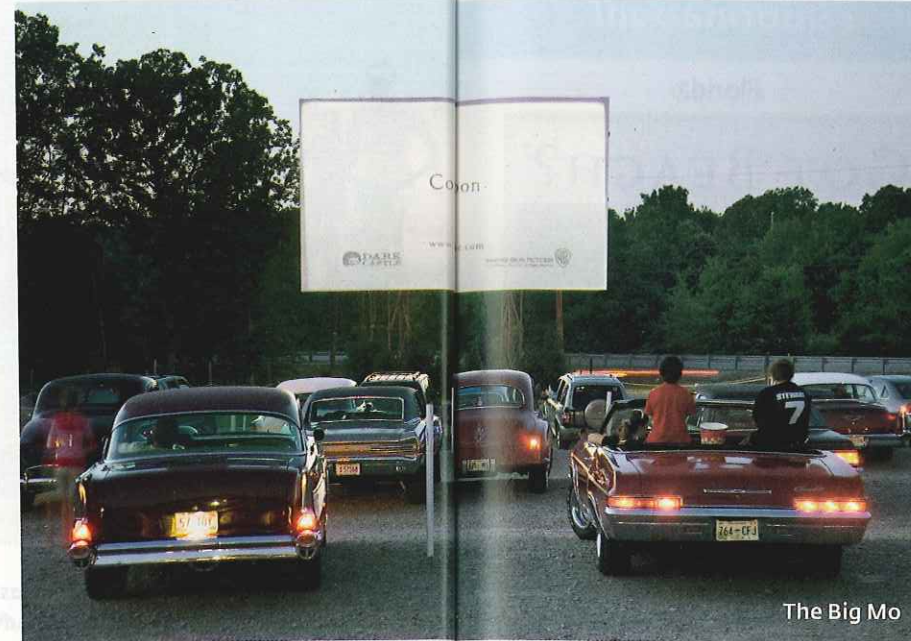
The Big Mo